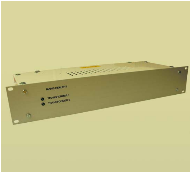
2U 19" Rack