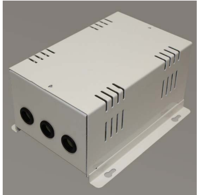
Picture shows single fuse fitted up to 4 O/P available.