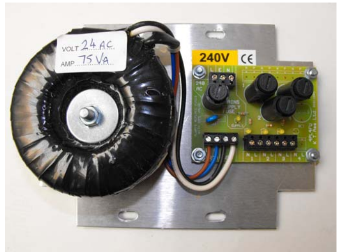
75VA Chassis Version