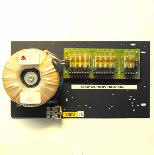
Picture shows 10 fused outputs available.