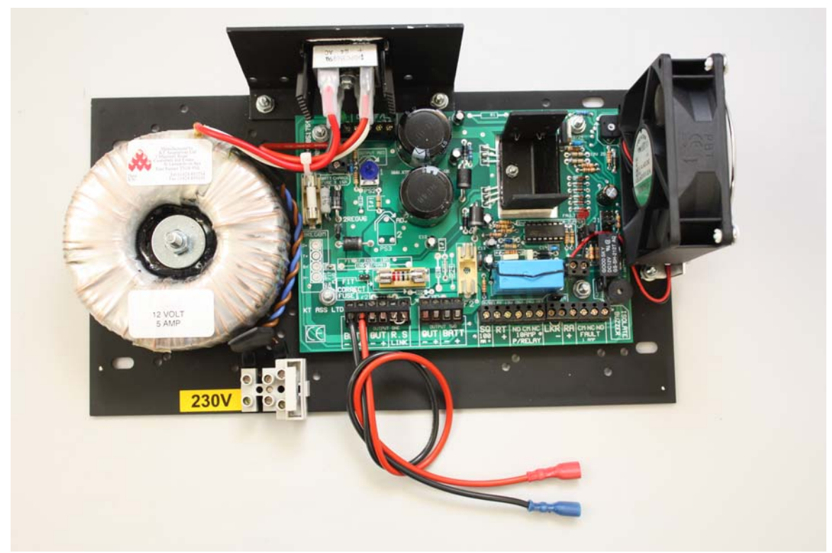
Illustration Shows Fitted Fan