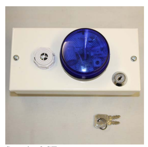
Sounder 2 ST