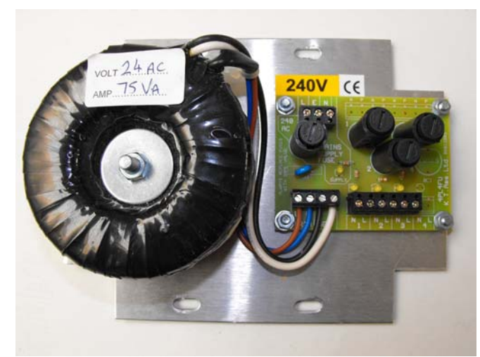
75VA Chassis Version